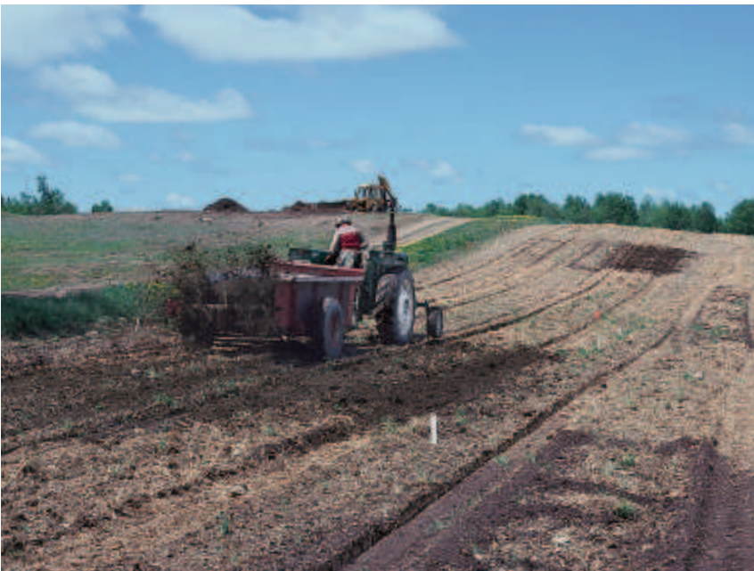
Applying compost, depicted in this SARE-funded project evaluating organic soil amendments to Maine potato fields, builds a healthier plant through healthier soil — and may suppress soil-borne diseases.

weed seed predators removed more than double the number of seeds from the no-till system compared to an adjacent conventional tillage system.