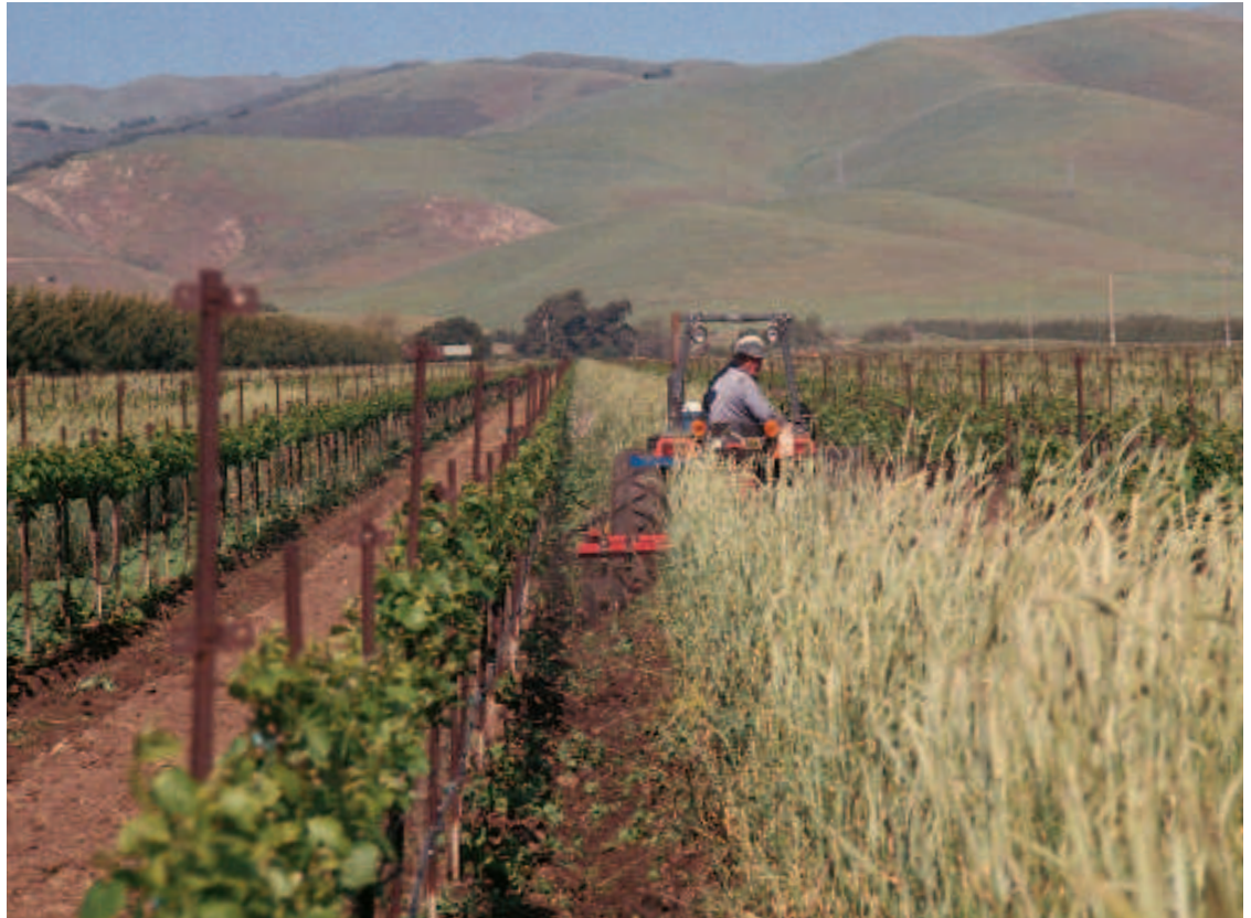
Growing rye between vineyard rows suppresses weeds — both by smothering and by producing allelopathic substances that inhibit weed germination — and attracts beneficial insects such as lady beetles to this vineyard in Monterey County, Calif.