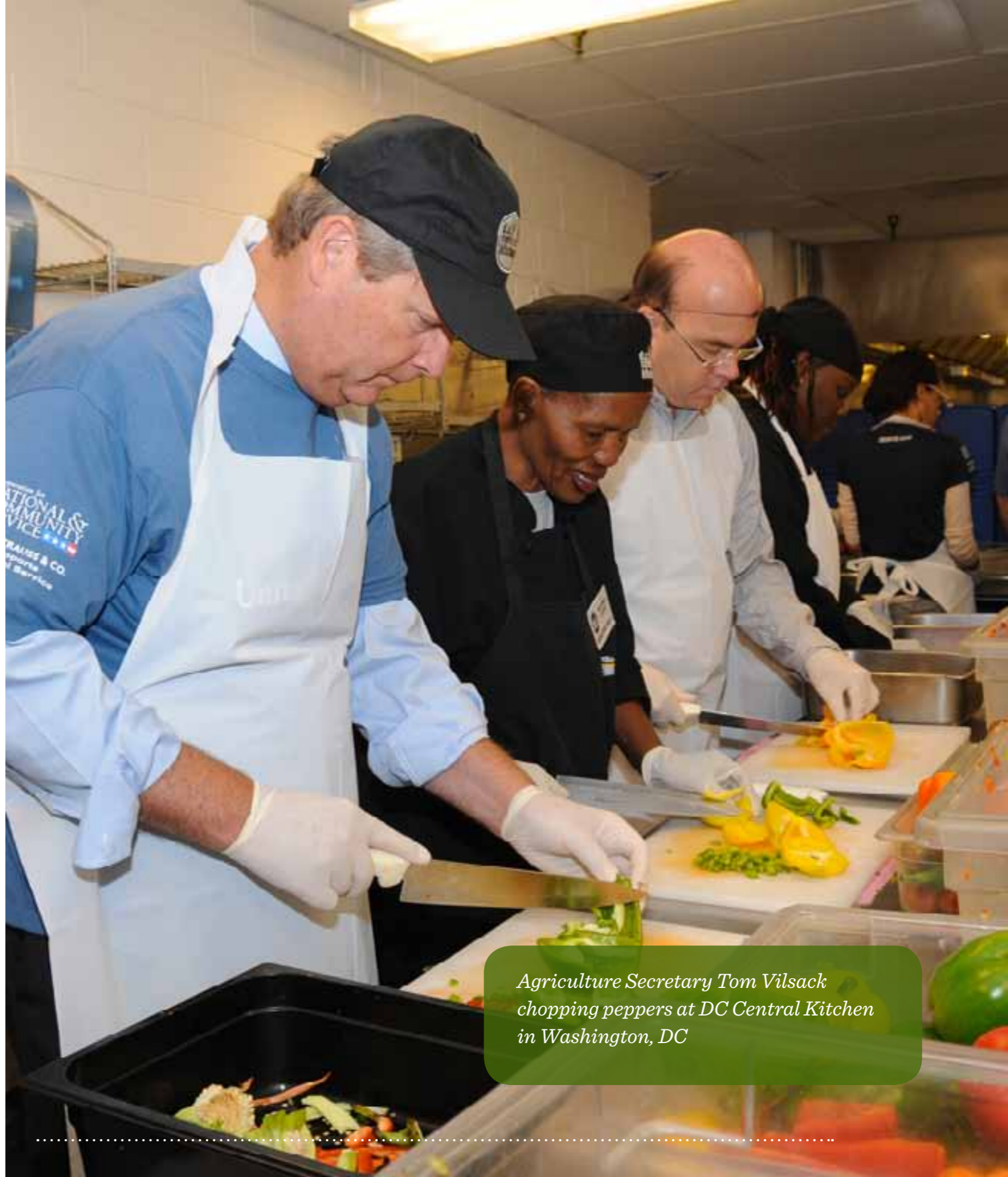
Agriculture Secretary Tom Vilsack chopping peppers at DC Central Kitchen in Washington, DC

Local food systems strengthen rural economies. Some research suggests that communities benefit economically when production, jobs and sales are retained locally. A 2010 study by USDA’s Economic Research Service looks at producers selling several products locally: spring salad mix, blueberries, milk, beef and apples. It then compares the performance of these marketing efforts to that of mainstream supply chains, where producers sell to wholesalers whose products are not necessarily then sold locally. The study finds that compared to their mainstream counterparts, revenue per unit for producers selling locally ranges from 50 percent greater for apples to 649 percent greater for salad mix. The study also finds that “[i]n all five cases, nearly all of the wage and proprietor income earned in the [local] market chains is retained in the local economy.”