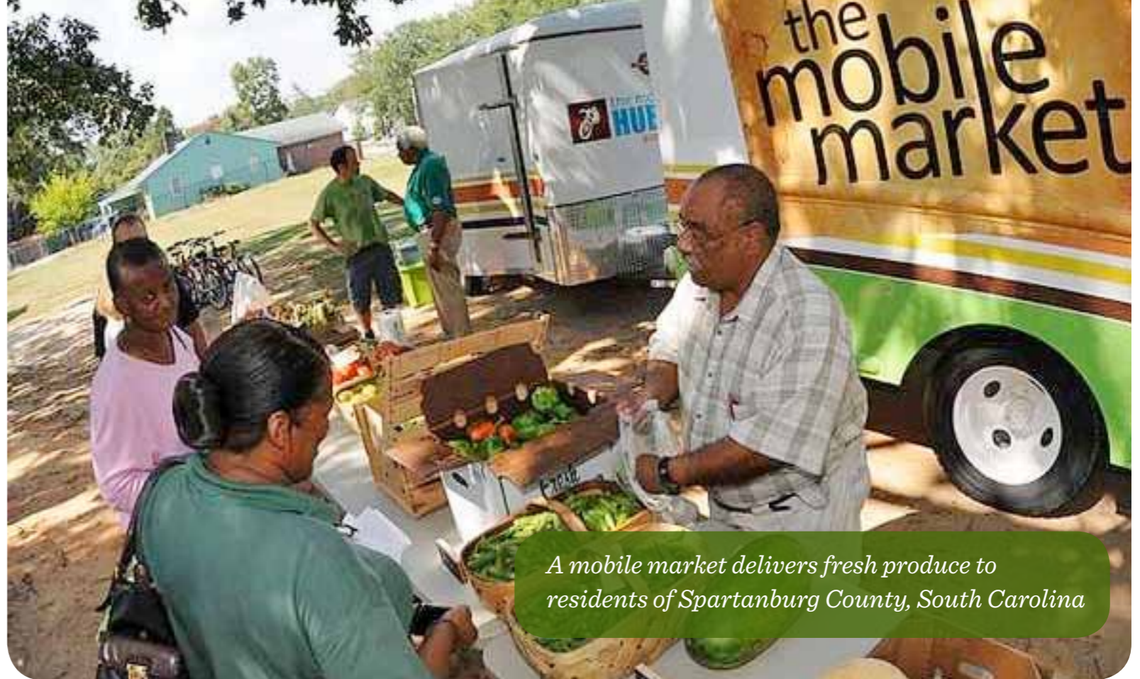
A mobile market delivers fresh produce to residents of Spartanburg County, South Carolina