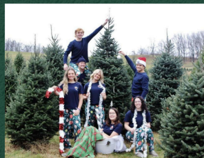
23-24 AC FFA OFFICER TEAM

“The officer team and I would like to wish every FFA member and their families a Merry Christmas! I am extremely proud of the accomplishments our chapter has achieved throughout the past year. I am excited to see what comes in 2024! Merry Christmas and Happy New Year!”